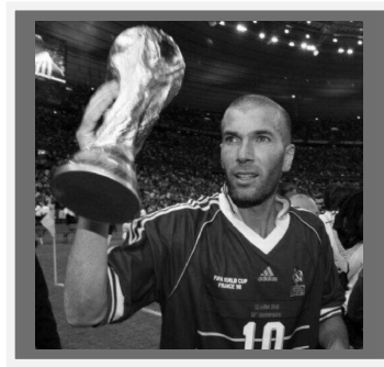
Zidane with the World Cup trophy

When he was 14, Zidane, or 'Zizou' as he was nicknamed, joined his first football club, AS Cannes. At the age of 20, he moved to Bordeaux Football Club. He was very successful there. In 1996, he joined Juventus, one of the biggest football clubs in Italy. He won two championships with Juventus. In 2001, he moved to Real Madrid, one of the greatest football clubs in Spain. Real Madrid paid 66 million dollars to Juventus for Zidane to play for them. This made him the world's most expensive player at the time.